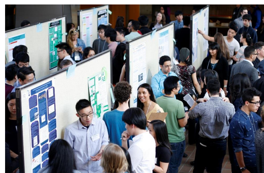
CHEM 341 Poster Session, Winter 2014